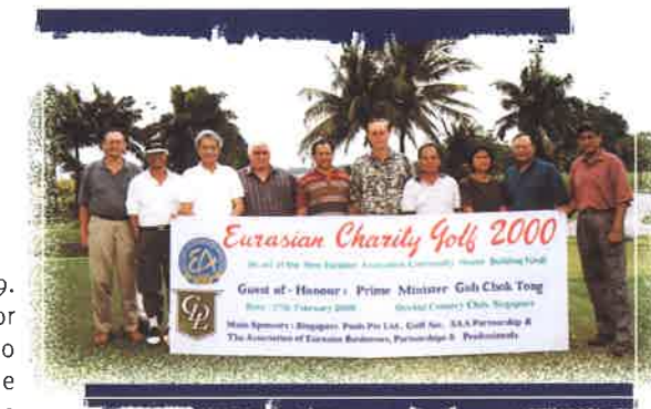
Eurasian Charity Golf 2000

Income during the year largely paralleled the pattern of 1999. The association would like to record its thanks to all donors for their generous contributions to the fund. An on-going task is to ensure that the maximum number of Eurasians within the community continue to contribute to this fund as it is the Association's major income source.