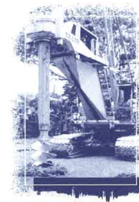
First pile into the ground

Since late last year, our project consultants have also separately made direct submissions to the various relevant technical departments/authorities in the run-up to obtaining Building Plan approval from the Building & Construction Authority by end-March this year.