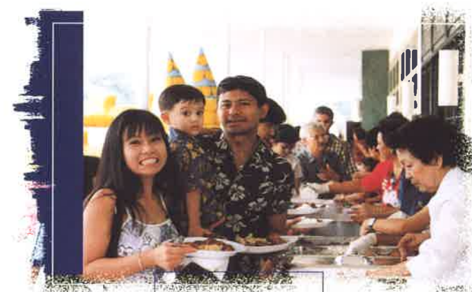
What's going on over there?

For the Children's Christmas Treat, each child received a snack pack in a hand-sewn goodie bag and a Christmas gift. The hard-working sub-committee organized a full programme of activities and entertainment to ensure that the children had a whole afternoon of fun. Two colourful bouncy playsets were also available for the children to play on the whole afternoon until it rained.