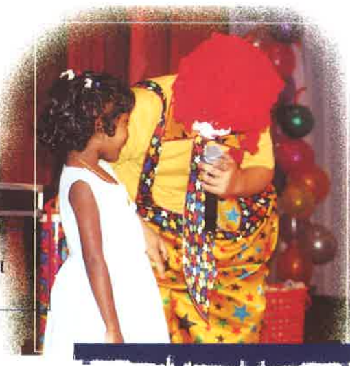
Fun and laughter for kids at EA's traditional celebration