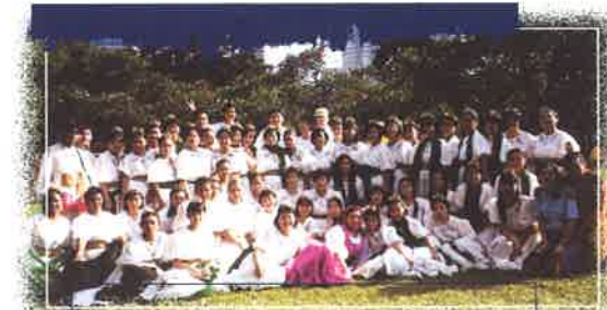
One for the album of the EA contingent

There were 18 participants who formed the EA contingent at the National Day Parade. For the first time some of our Eurasian dancers were chosen to join the other three major ethnic races in a specially choreographed item on the main stage at the Parade.