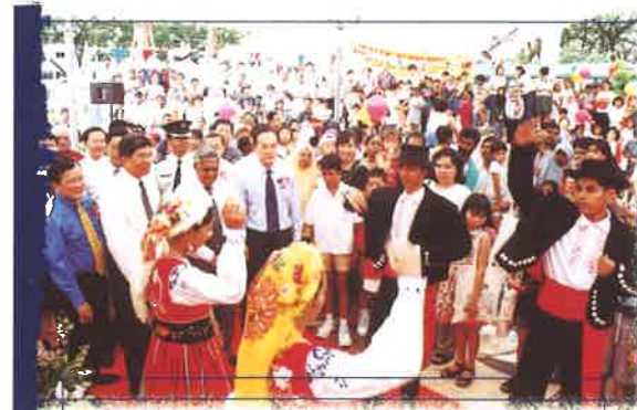
Our dancers took centrestage at the Opening of the Joint Social Service Centre