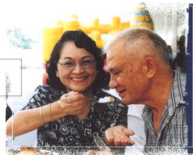
Having lunch at EA Family Day