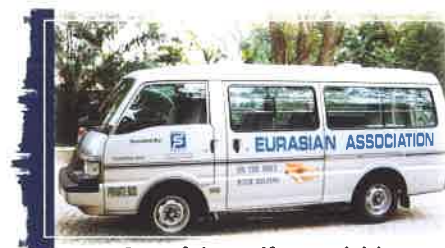
One of the welfare activities