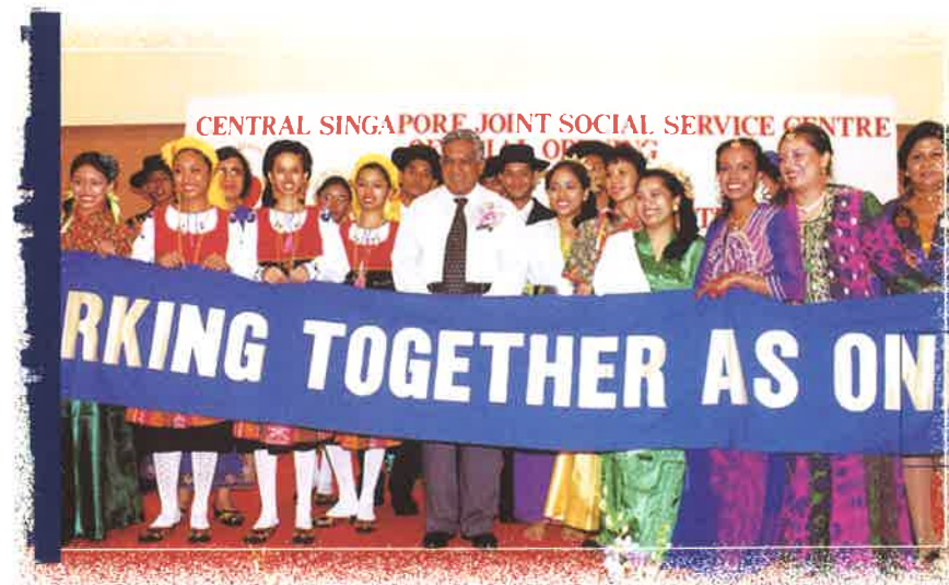
Posing with President Nathan at the Joint Social Service Centre