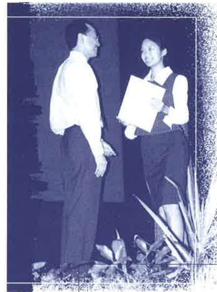
One of the recipients at the award ceremony

In 2000, 193 awards valued at $26,650 were disbursed. Recipients of the Excellence Award received a special plaque and a book voucher, while other recipients received certificates and cash.