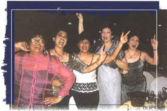
Enjoying a good time at NYE Millennium Ball