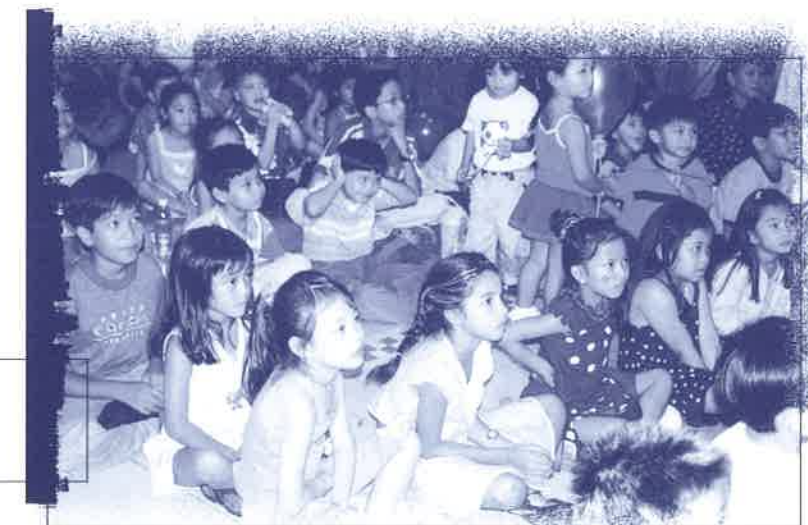
Children at EA Family Day

Two meetings of the Board of Trustees and two of the Selection Committee/Finance Review Committee of the Association's Endowment Fund were held during the year.