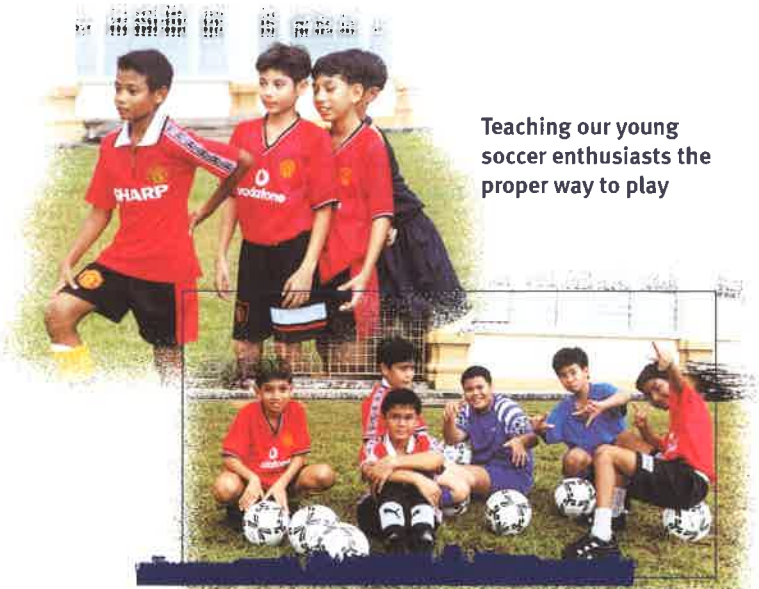
Teaching our young soccer enthusiasts the proper way to play

Attempts at reviving this activity were not fruitful due to lack of participants. However, we are not abandoning our attempts. We will continue to revive this sport.