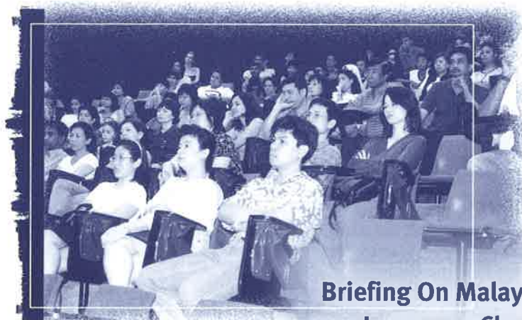
Briefing On Malay Language Classes

The SINDA, CDAC and Malay Tuition programmes were discontinued in November 2000 with the exception of tuition in Mandarin at CDAC centres. Parents were duly informed by letter of this decision, the reasons for which were twofold, firstly, schools provide academic tuition to weak students under the umbrella of remedial classes, and secondly, EA is channelling funds into programmes to improve the performance of Eurasian students in the Mother Tongue (Malay and Mandarin), two consistently weak areas. The EA recognises that Mother Tongue is not one of our strong subjects and traditional programmes have not been effective, hence the new focus.