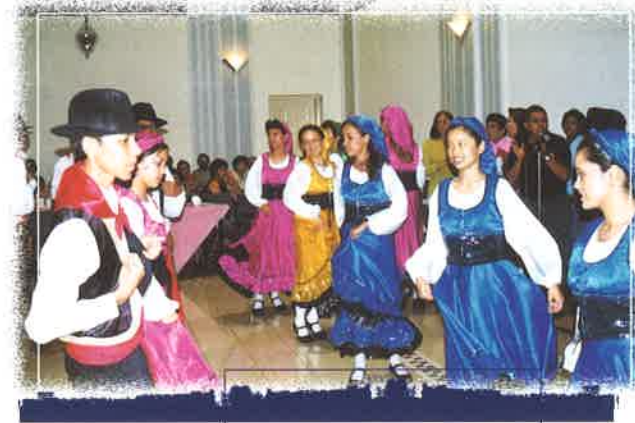
Our Song & Dance Troupe

Channel 12: Malay Media did a short play incorporating our Kristang class as well as our dancers. Channel 8: Chinese media featured our dancers on their programme on X'mas Day. Channel NewsAsia: Our dancers were filmed at the Art Museum (former SJI) for Channel NewsAsia's programme "Young Asians celebrate."