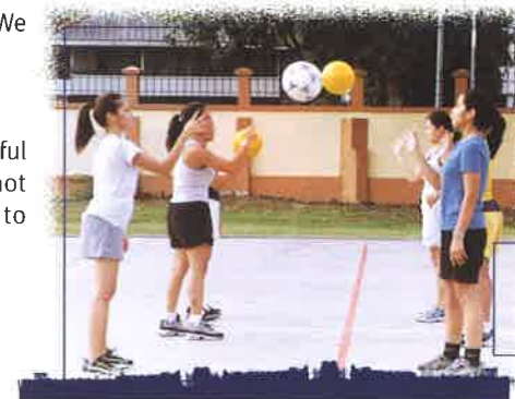
Join these pretty ladies