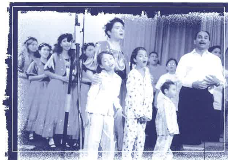
Joining in the EA Song and Dance Troupe

Elementary education was provided initially to a dysfunctional family consisting of a mother and two children. The case was subsequently referred to the Movement for the Intellectually Disabled in Singapore (MINDS). We are currently providing basic education to 3 EA Song and Dance Troupe girls.