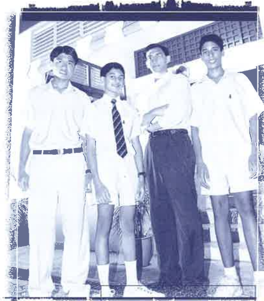
Four of EA's top students

One computer was loaned to a student pursuing a diploma course.