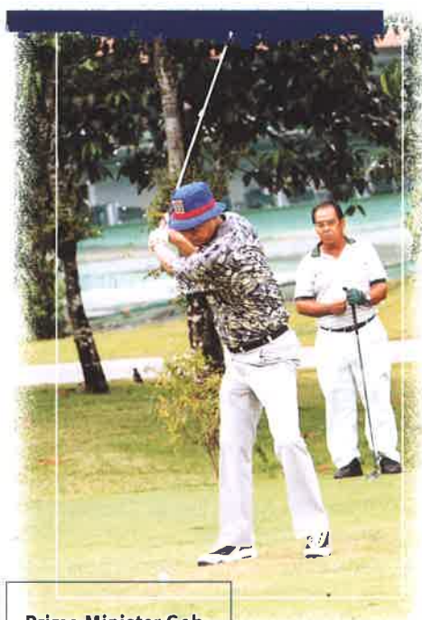
Prime Minister Goh Chok Tong teeing off the charity event