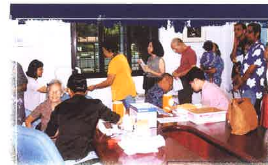
A new way to keep in touch and stay healthy at the same time

In April 2000, the Welfare Committee with Parkway Holdings Ltd organised free health screening for some 102 Eurasians.