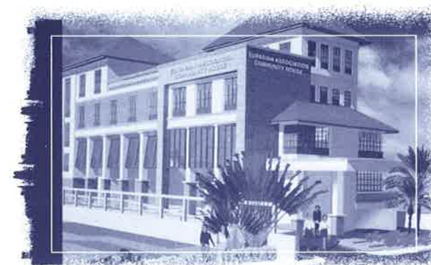
The new EA Community House