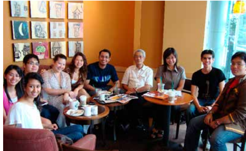
MYLN Chillout@Starbucks session in February 2009

We asked a few of Eurasian youths online and here are some of the interesting inputs we received.