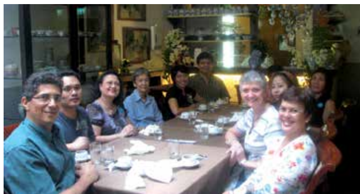
After educational tour of the Peranakan Museum