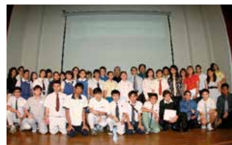
Excellence Award recipients