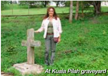
At Kuala Pilah graveyard