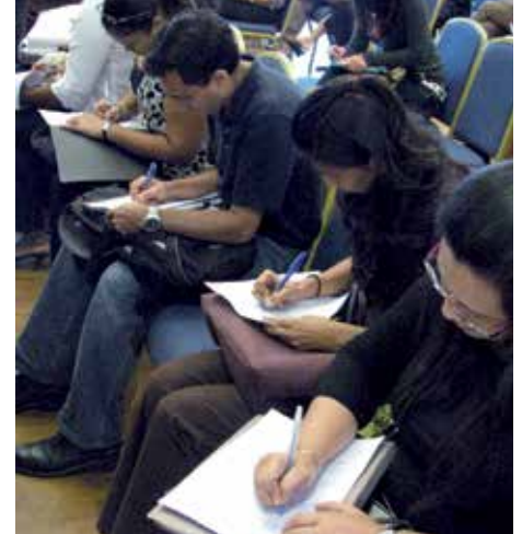
Engrossed participants at the symposium