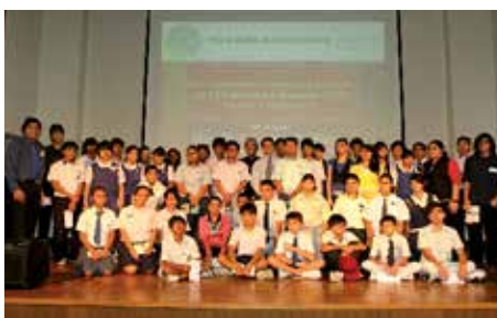
Bursary Secondary and Tertiary recipients

In the October 2008 issue, on page 2 regarding students receiving the ECF Education awards, we got the captions of two photos mixed up. Below are the photos and correct captions, apologies for the confusion.