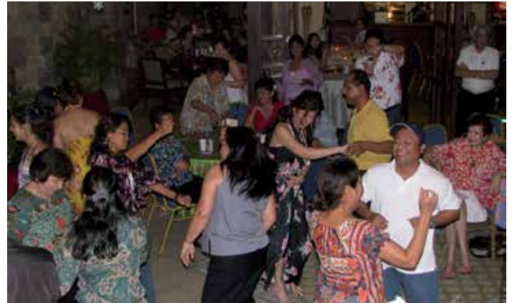
Dancing the night away at the Garden Party