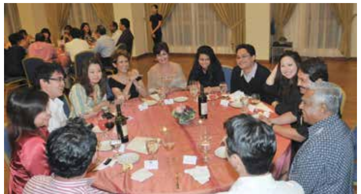
Youth and Heritage Group members chatting with President Nathan