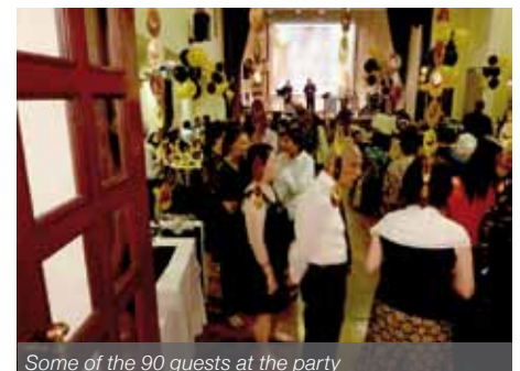
Some of the 90 guests at the party