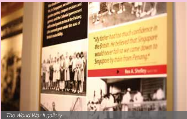
The World War II gallery

The Eurasian Heritage Centre houses exhibits that showcase the history, culture and achievements of the Eurasian community in Singapore.