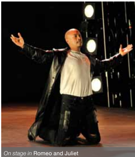
On stage in Romeo and Juliet

“You should only be an actor if and when you're absolutely sure there's nothing else you would be happy doing”