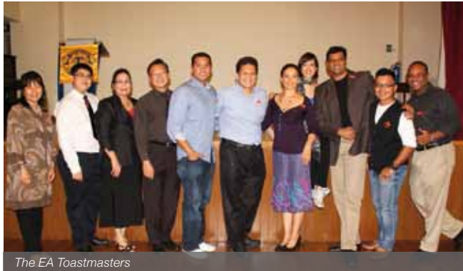
The EA Toastmasters

good English in a languid and non-contrived manner. It was also the warmth that I felt from the club – and how each and every member supported it, from those in official roles right down to those providing food and drinks and simply helping arrange the chairs for the meeting. It may be daunting for a new member to do his or her 'Ice Breaker' speech or for a visitor to deliver a Table Topic – completely impromptu – to what might be an audience of mostly strangers.