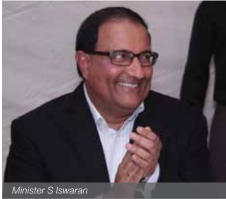
Minister S Iswaran

Minister S Iswaran has been nominated by Prime Minister Lee Hsien Loong to represent the Eurasian community in the Cabinet. Mr Iswaran replaces former Foreign Minister George Yeo, who held the post for many years.