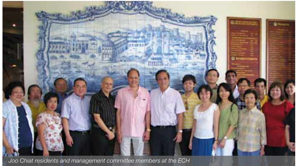
Joo Chiat residents and management committee members at the ECH