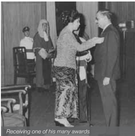
Receiving one of his many awards