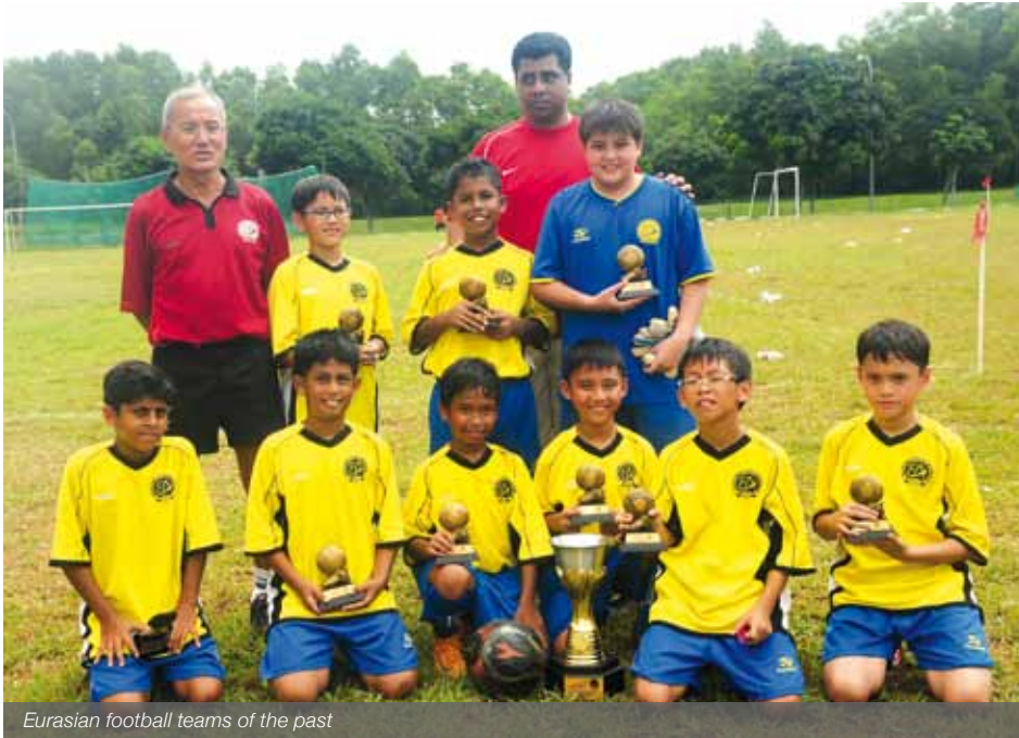
Eurasian football teams of the past