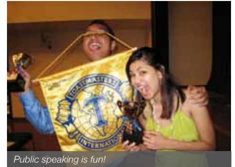
Public speaking is fun!

However, the club makes that less of a challenge with the full support members give to each speaker and the invaluable evaluations that stem from people who know their craft and – more importantly – are willing to share it.