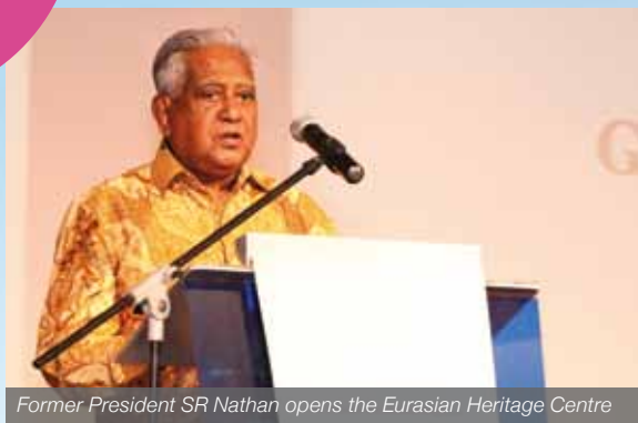
Former President SR Nathan opens the Eurasian Heritage Centre

Singapore played host in March to more than 200 guests from the Asia-Pacific region for a two-day gathering of Eurasians that included a celebration of heritage, a conference looking into the future and – not least of all – a gala dinner for Eurasians in Singapore and the region to get together