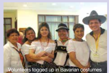
Volunteers toggged up in Bavarian costumes

In between the table games and two rounds of tombola, the New Vintage band played great music for listening and dancing. The lucky draw prizes were always keenly anticipated, with prizes donated generously by members of the community. It was a lovely party, thanks to the ladies from the Women's Wing for organizing it with such great gusto.