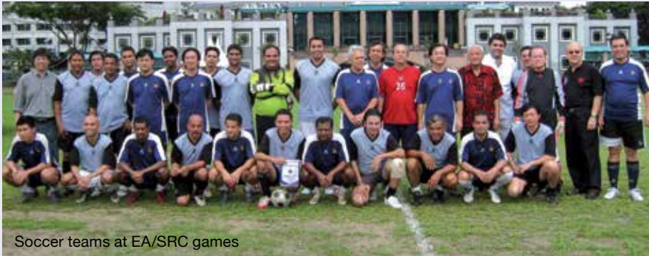
Soccer teams at EA/SRC games