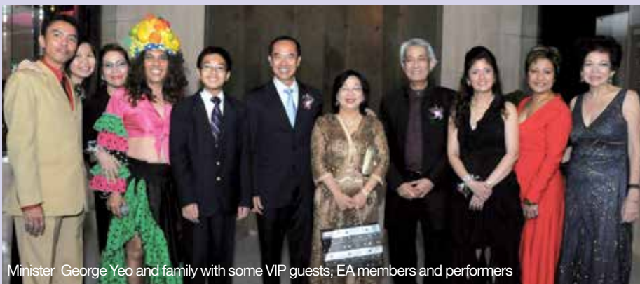
Minister George Yeo and family with some VIP guests, EA members and performers

The New Year's eve ball has long been a tradition within the community which is eagerly anticipated year on year. The challenge last year was to top the 2007 ball and after much discussion the committee decided to go with a 'Movie Star Glamour' theme which would revolve around an era which epitomised glamour and sophistication. The crowd of 300 or so did not disappoint with the ladies working the red carpet with sparkling gowns and lots of bling and the men in tuxedos and even a cowboy to boot. Marina Mandarin Ballroom was transformed into a movie set with the 'stars' enhancing the glamour factor.