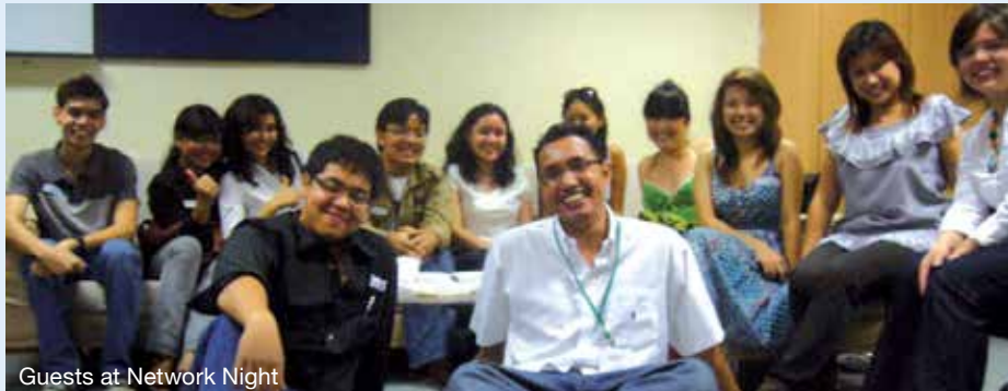
Guests at Network Night

The MYLN, officially launched at the ECF awards on 6 September, is an avenue in which young Eurasian professionals from a variety of backgrounds can provide guidance to Eurasian students while in the process networking with each other.