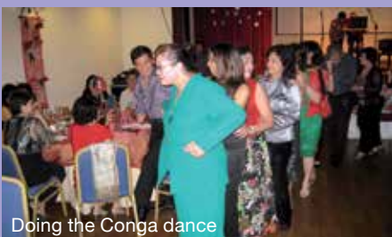
Doing the Conga dance