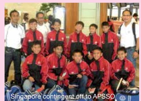
Singapore contingent off to APSSO