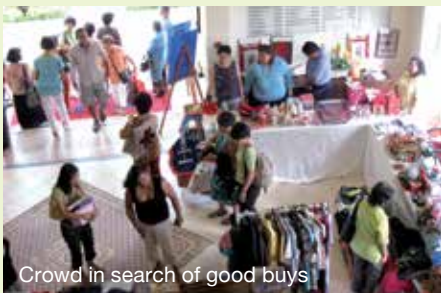
Crowd in search of good buys

The Women's Wing committee embarked on a plan to tie in the 2nd Movie Screening at the Eurasian Community House with a Thrift Shop to cater to the community and our FSS clients. This initiative took weeks of planning and on Saturday, 15 November at 11am, the stalls were set up with a wide array of second-hand clothes, books, toys, games and lots more. This was showcased on our e-blast, magazine and Facebook.