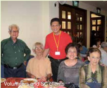
Volunteers and SC clients