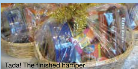
Tada! The finished hamper