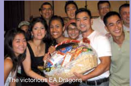
The victorious EA Dragons

that the food and atmosphere of the afternoon’s activities provided an incentive for most to return when the next lunch rolls around in January. Till then, have a blessed Christmas and a peaceful 2009.