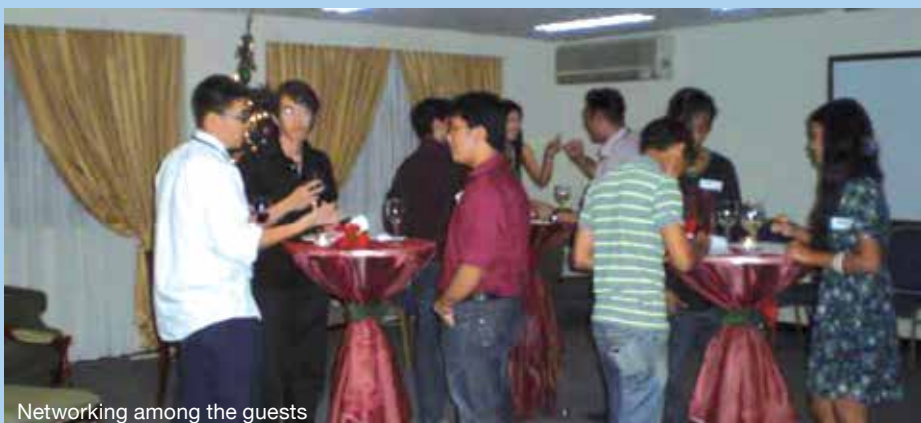
Networking among the guests