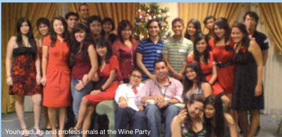
Young adults and professionals at the Wine Party

The next MYLN event will be the Chillout @ Starbucks in February 2009. If you would like to be kept abreast with our activities, do drop us an email at coelhoz@gmail.com or join our Facebook group – "Eurasian Association Mentoring Young Leaders Network."