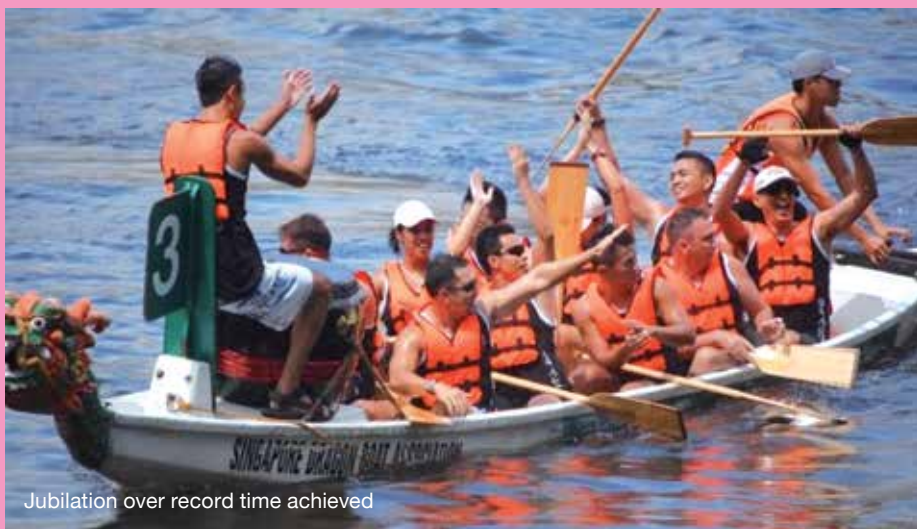
Jubilation over record time achieved

Singapore River Regatta Dragon Boat Race 2008