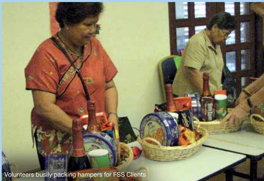
Volunteers busily packing hampers for FSS Clients

Support Services. The ladies, mainly from the Women's Wing, promptly got down to work. In assembly-line fashion, they set to lining the baskets before painstakingly arranging the goodies in them.