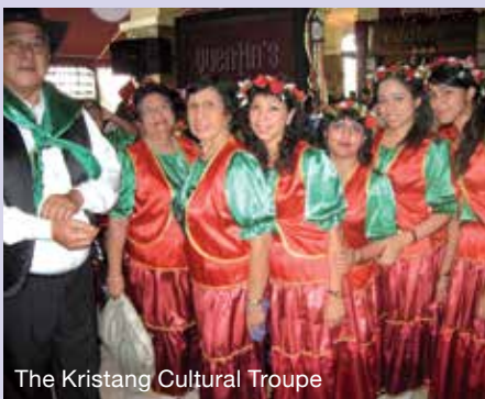
The Kristang Cultural Troupe