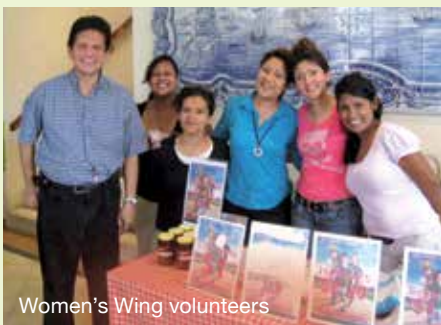
Women's Wing volunteers