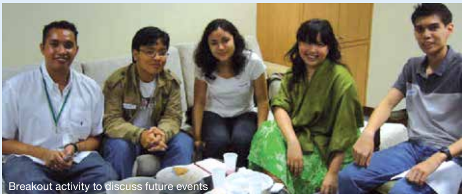
Breakout activity to discuss future events