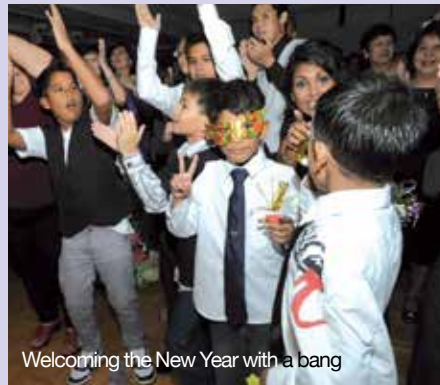
Welcoming the New Year with a bang