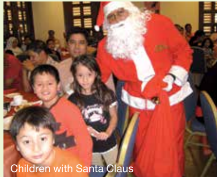
Children with Santa Claus

Every year, Family Support Services (FSS) hosts a party for our clients to promote social interaction, allow them to tour the Eurasian Community House and to spread the Christmas spirit among them.