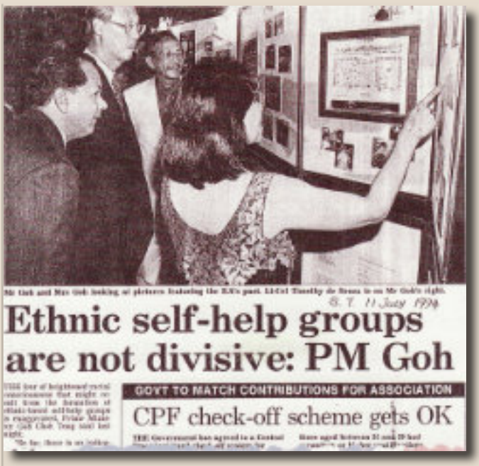
Extract from Straits Times, 11th July 1994

In an EGM on 11th Feb 1995, all members present gave full backing to the amendments, and the Eurasian Community Fund (ECF) was established.