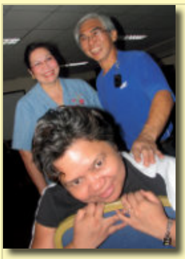
Enjoying a shoulder rub

No, aliens have not become members of the Eurasian Association. It was just someone saying that she had booked two head and shoulder massages and one foot reflexology session. The Silver Circle together with the Singapore Association of the Visually Handicapped (SAVH) had organised the massage session. This is the third time they have run this charity event. A twenty minute session provided by visually handicapped masseurs cost twelve dollars. All monies raised went to the SAVH.