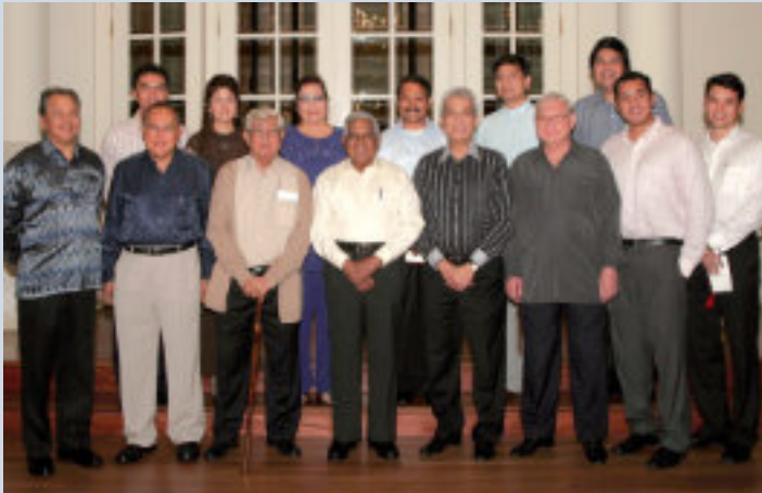
President S.R. Nathan with our EA Patron, Trustees and the new Management Committee after dinner at the Istana, 6th April 2008

With a quick step and a jump, the new Management team got off their marks very fast getting all their official calls sorted out soon after the Annual General Meeting.