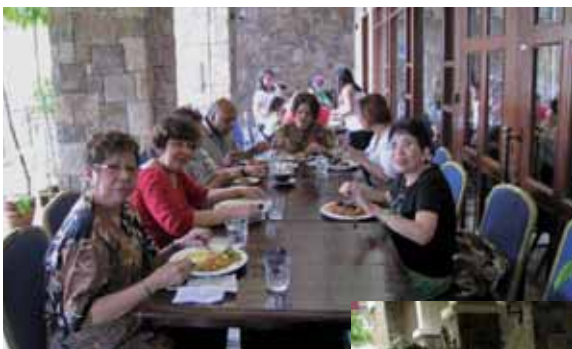
EA members enjoy Sunday lunch at Quentin's