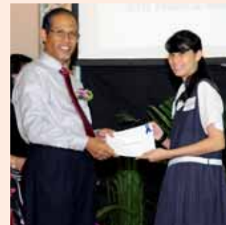
Last year's ECF Education Awards ceremony