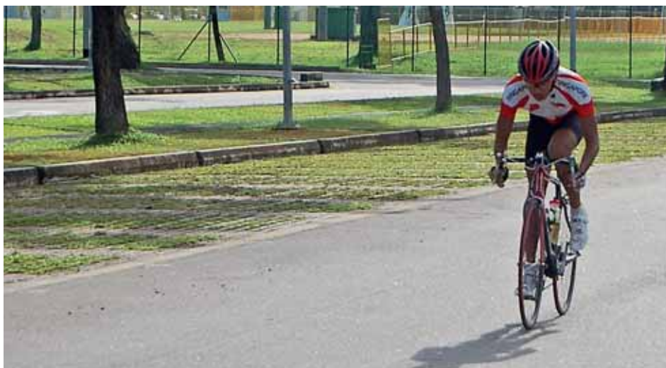
An early-morning training session at Kallang

He is deadly serious about his ambitions – he has even opted to postpone his schooling for two years to continue his training. His training schedule for the Olympics starts before dawn to spend two hours on race simulation training. He might catch up with