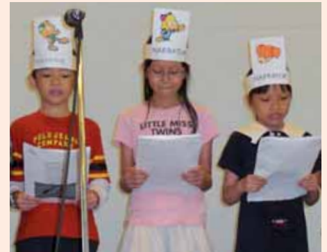
Children perform at the storytelling workshop