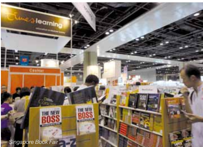
Singapore Book Fair

The charity project was supported by Kwan Im Thong Hood Cho Temple and organised with the four self-help groups. Seventy Eurasian students were among the recipients and each received vouchers worth $40, which they could use to buy textbooks and other reading materials. The vouchers were presented by Grace Fu Hai Yien, Senior Minister of State for Information, Communication and the Arts.