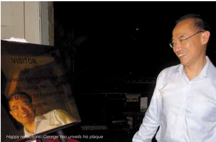
Happy reflections: George Yeo unveils his plaque