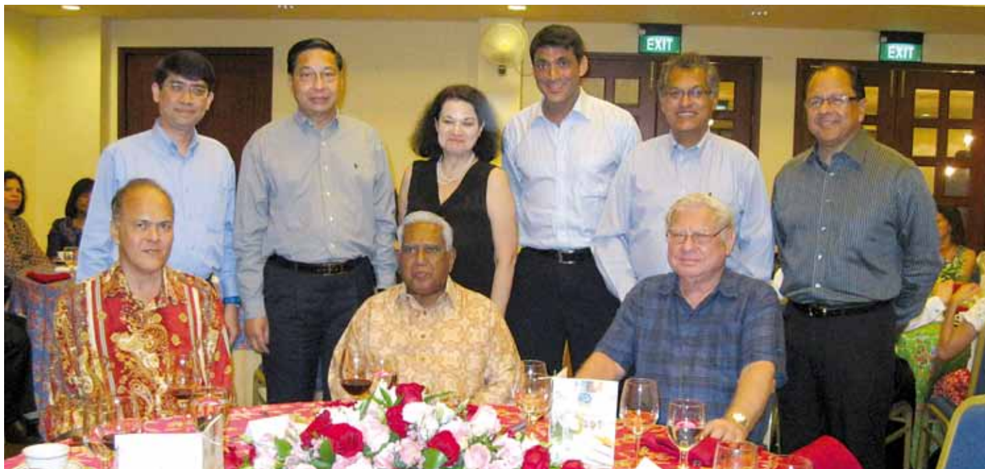
President SR Nathan with the patron, trustees and management committee during his visit to the ECH