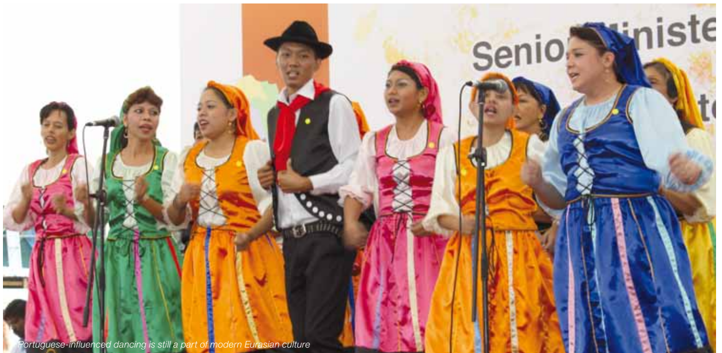
Portuguese-influenced dancing is still a part of modern Eurasian culture

The trading networks and modes of production that the Portuguese had systematised throughout the region became a platform on which other European powers piggybacked