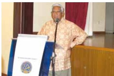
President Nathan recalls his times with Eurasians