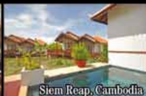
Siem Reap, Cambodia