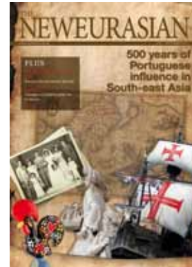
On the Cover