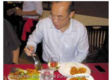
George Yeo enjoys some Eurasian cuisine