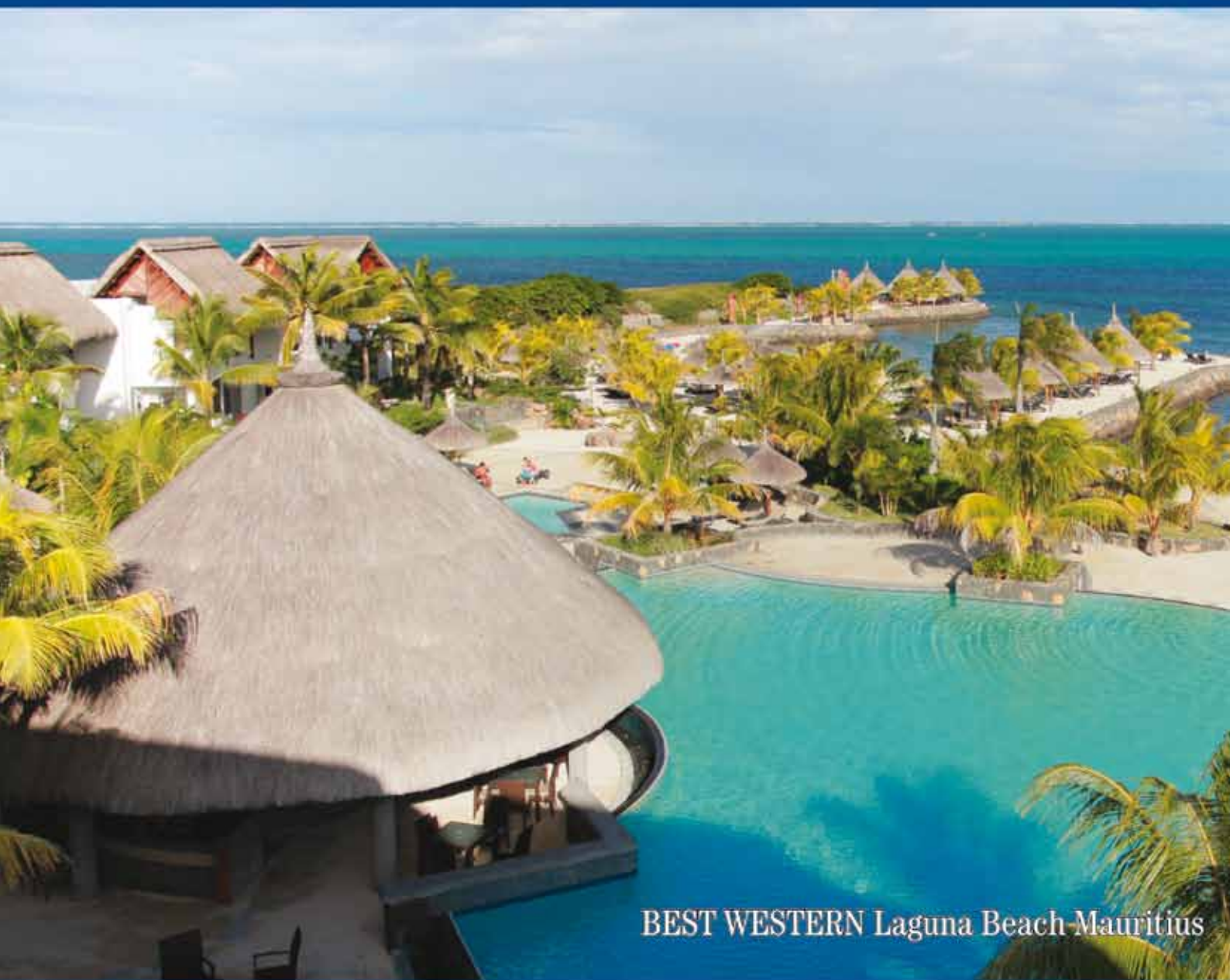
BEST WESTERN Laguna Beach Mauritius