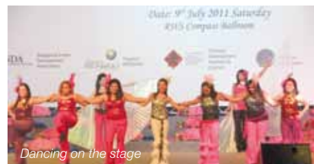
Dancing on the stage

This year's Inter-Racial, Inter-Religious Harmony Nite was held at Resorts World Sentosa on 9 July with the usual colour and pomp that has come to mark this event to promote better understanding between the nation's diverse cultures.