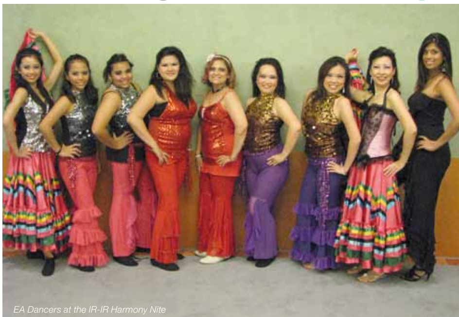
EA Dancers at the IR-IR Harmony Nite