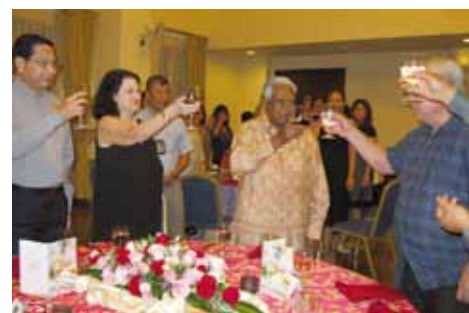
Raising a toast to the President

President SR Nathan has enjoyed a long association with the Eurasians – both in a professional and private capacity – and he was recently the EA's special dinner guest at the Eurasian Community House.