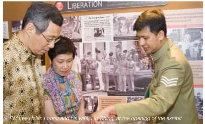
PM Lee Hsien Loong and his wife, Ho Ching, at the opening of the exhibit

The World War II gallery at the ECH is to receive a much-needed facelift – and benefactors are sought to help safeguard this important piece of Eurasian history