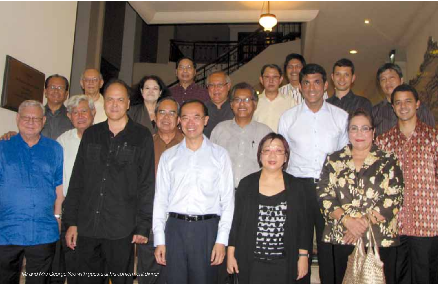
Mr and Mrs George Yeo with guests at his conferment dinner