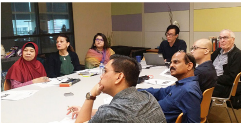
Participants undergo training to act as interviewers in the oral history project