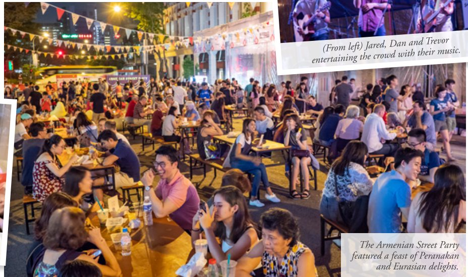
The Armenian Street Party featured a feast of Peranakan and Eurasian delights.