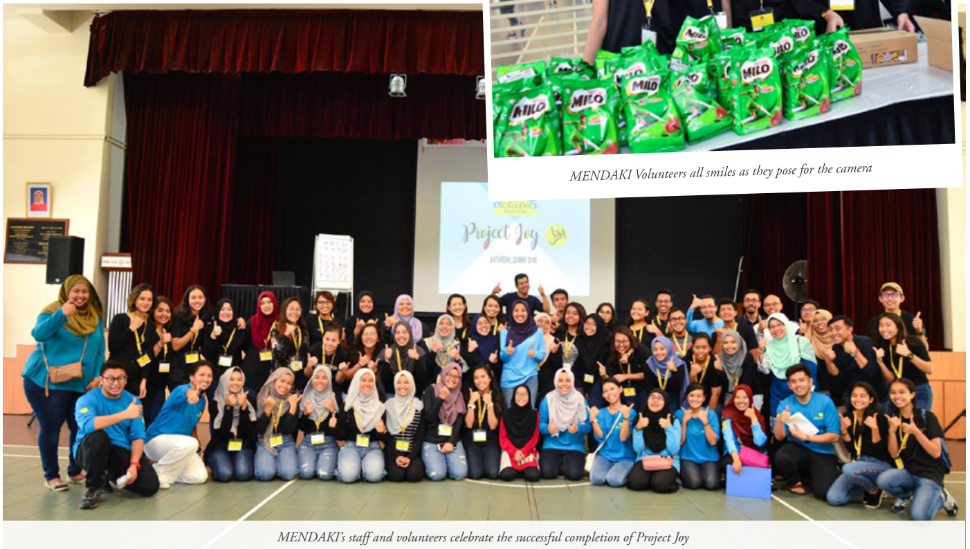
MENDAKI's staff and volunteers celebrate the successful completion of Project Joy

On top of receiving festive gifts, parents also participated in a digital quotient workshop, where they learnt tips on how to help their children navigate the online world safely and responsibly.