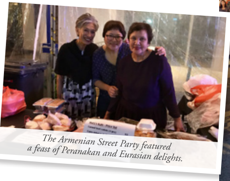
The Armenian Street Party featured a feast of Peranakan and Eurasian delights.