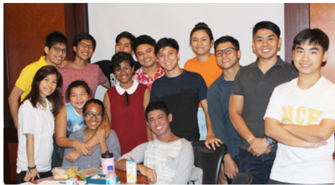
The Young Eurasian Leaders' Programme also gave participants a chance to get to know and learn from one another.

The comprehensive leadership development programme began with a leadership challenge, where participants were introduced to the five practices of exemplary leadership. They were taught different leadership techniques and how to apply them to real-life challenges by a trainer from Halogen Foundation, a local youth development charity. During the course of the challenge, the youth were also encouraged to reflect on their own leadership skills and development through exciting thought-provoking games.