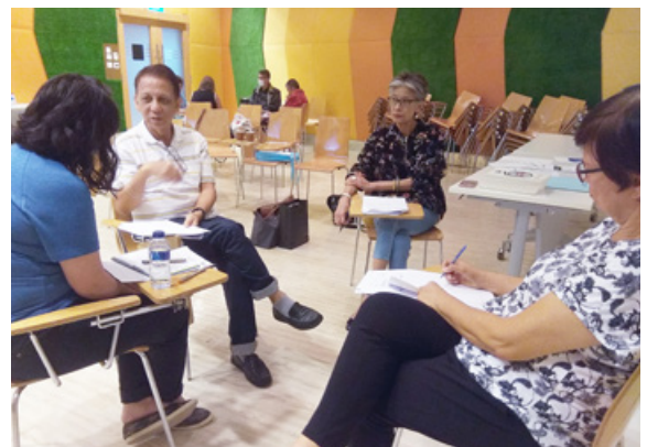
Participants actively engaged in training