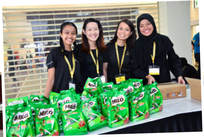
MENDAKI Volunteers all smiles as they pose for the camera

The event took place at Geylang West Community Centre on 19 May, and was graced by Yayasan MENDAKI Chairman Dr Yaacob Ibrahim, who was the guest of honour.