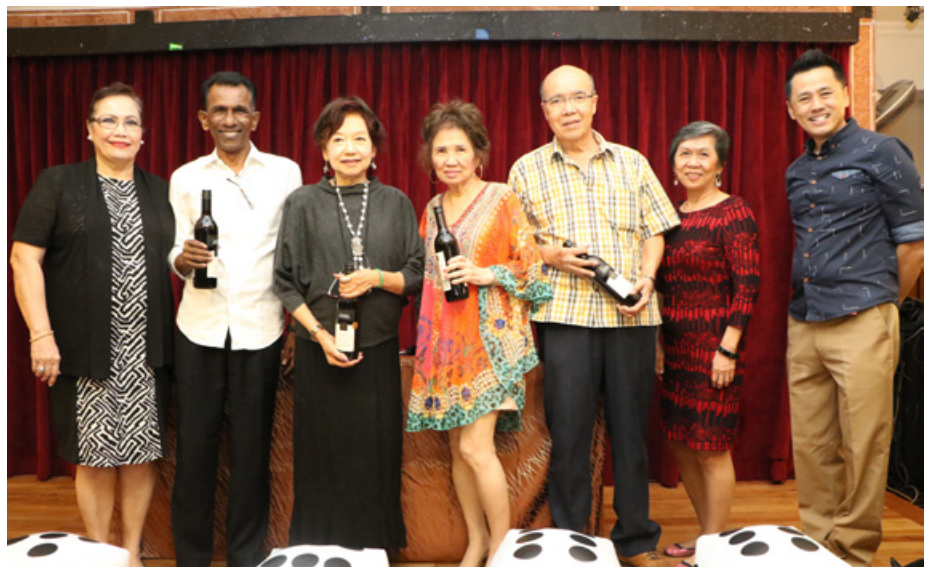
34th Inter-club Chivas Regal Balut Competition Round 1 Champions

SRC will host the 38th Chivas Regal Interport Balut Competition on 23 and 24 November.