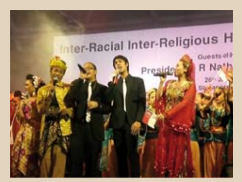
Singing the grand finale song.