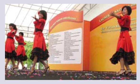
EA's very own PAC dance group letting their hair down.

The EA invites you to step forward and join us as we bring Eurasian delights (music, dance, food, stories and sports) onto the national level.