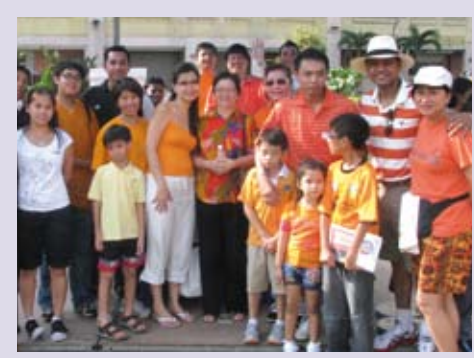
A group photo at our food booth.