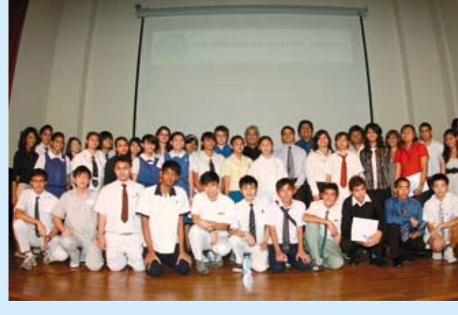
Bursary Secondary and Tertiary recipients.