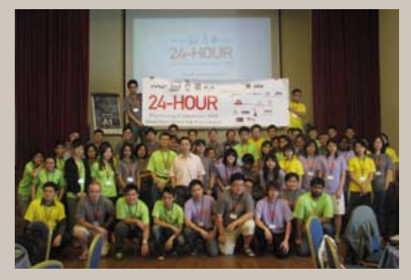
Participants of playwriting competition at ECH.