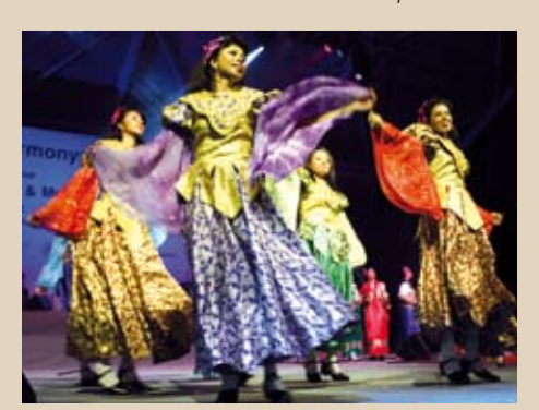
A colourful show by the Kristang dancers.