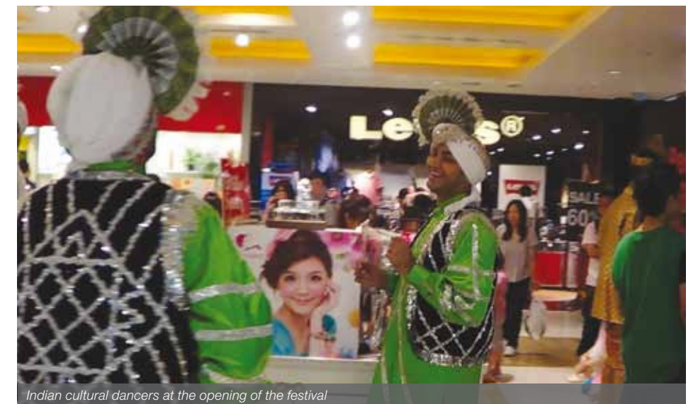
Indian cultural dancers at the opening of the festival