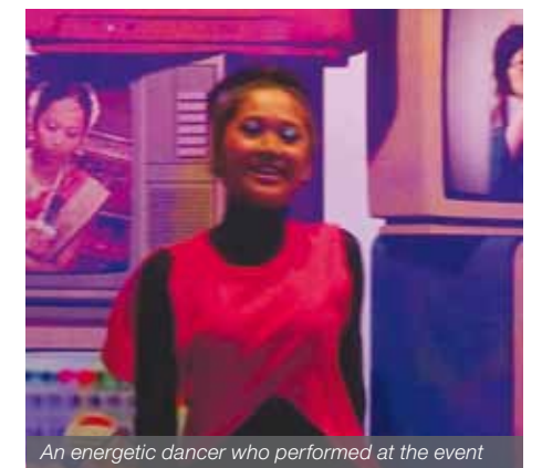
An energetic dancer who performed at the event