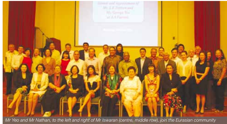
Mr Yeo and Mr Nathan, to the left and right of Mr Iswaran (centre, middle row), join the Eurasian community