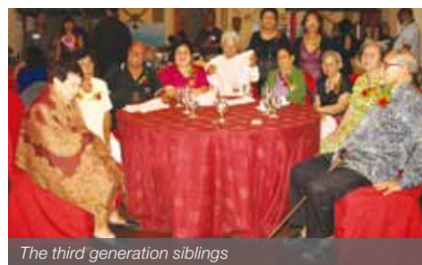
The third generation siblings