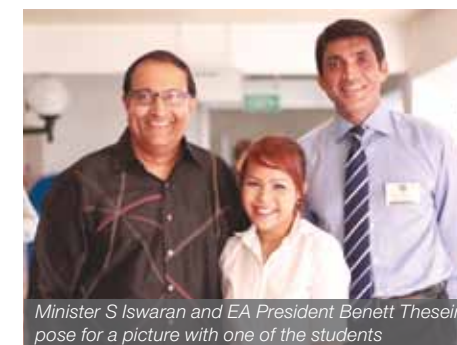
Minister S Iswaran and EA President Benett Theseira pose for a picture with one of the students