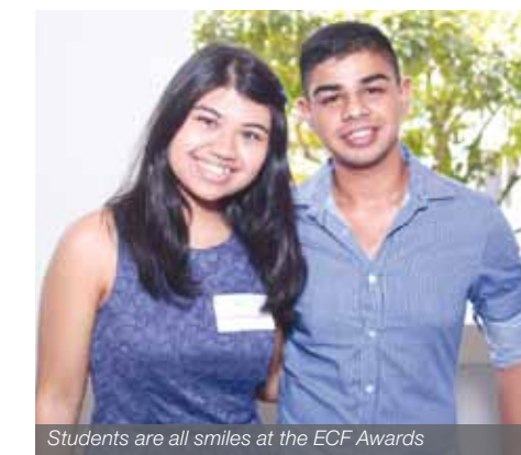
Students are all smiles at the ECF Awards