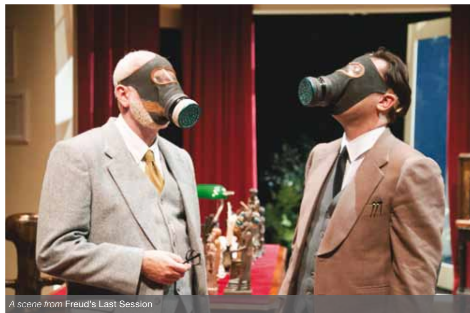
A scene from Freud's Last Session

France in the 1950s. A real 'who dunnit' play that satisfies my interest in murder/crime plays – plays with blood, guns and suspense! For reasons totally unconscious to me, I've in the past gravitated towards plays with all men casts. This play breaks that cycle with a cast of eight women. I'm not sure how directing an oestrogen-pumped cast will be, but for a gal who loves a challenge I'm quite looking forward to it!