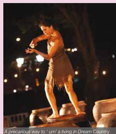
A precarious way to 'urn' a living in Dream Country