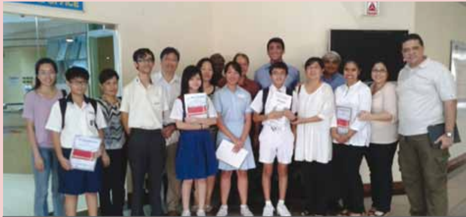
Joint Tuition Award recipients and parents with EA President Benett Theseira and the management committee

The EA strongly encourages Eurasian students to register for these tuition classes as they not only provide affordable, subsidised tuition at conveniently located venues but also offer the opportunity to make friends from other cultures.