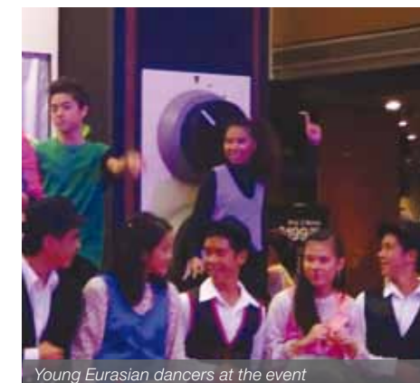
Young Eurasian dancers at the event