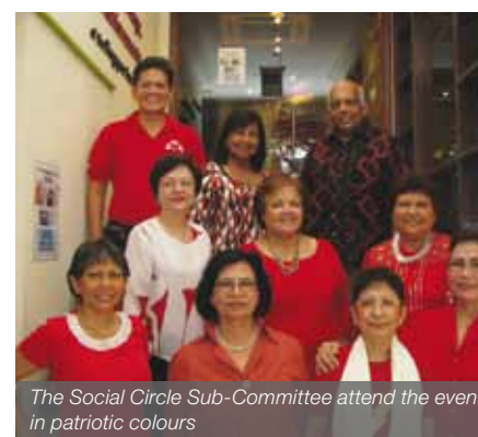
The Social Circle Sub-Committee attend the event in patriotic colours