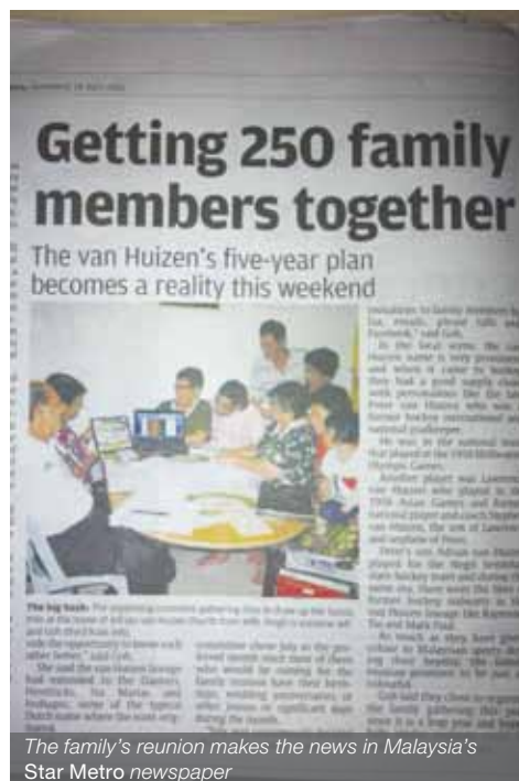
The family's reunion makes the news in Malaysia's Star Metro newspaper