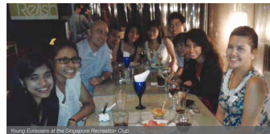
Young Eurasians at the Singapore Recreation Club

The Youth Committee is planning its third YPE gathering, which is slated for 8 November. It is also planning a separate town-hall-style dialogue session between themselves and members of the EA management committee.