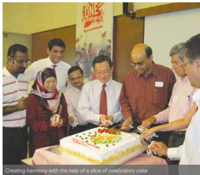
Creating harmony with the help of a slice of celebratory cake

Members of the four community self-help groups (SHGs) came together in August in a show of harmony at a National Day Observance Ceremony held at the OnePeople.sg multi-purpose hall in Toa Payoh.