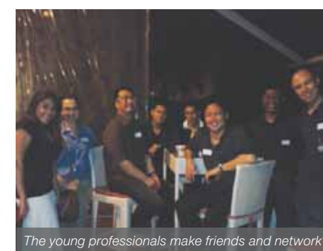
The young professionals make friends and network

The discussion will focus on the challenges of forging a youth-driven Eurasian community. This two-hour dialogue session is slated for 24 November.