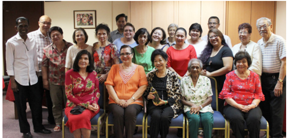
5th Round In-House Balut players all smiles as they pose for a group photograph

The 3rd Round of the 34th Chivas Regal Inter-Club Balut Competition was hosted by the National University of Singapore