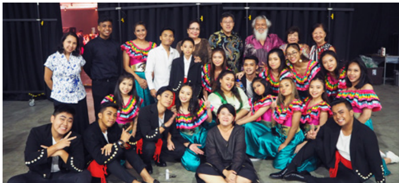
Members of the Eurasian Folk Dance Team

The annual Inter Racial Inter Religious (IRIR) Harmony Nite was held on 14 July to acknowledge the need to continue building trust and understanding between people of different races and religions. The theme for this year was 'Harmony: Where Our Hearts Meet'. It celebrates and represents Singaporeans' common hope of peace, values and success despite the differences in religion and race, as we live in harmony – where our hearts meet.