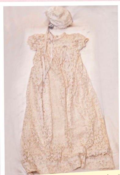
Christening robe with bonnet, made from the veil of the bride's wedding gown, to show continuity in the family

Other treasures were family heirlooms such as a baby's christening robe that was refashioned from a bride's veil. This was a common tradition in Eurasian families to symbolise continuity in the families' heritage. Another was a three-tiered cake stand, a wedding gift in 1913, passed down through generations to serve sugce cake at Christmas.