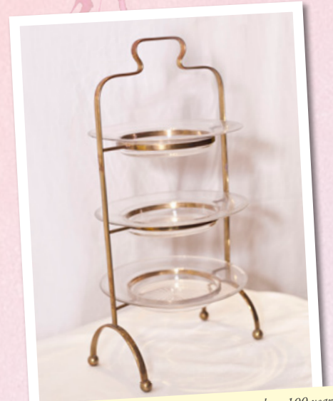
3-tier cake stand (circa 1913) which is more than 100 years old and was used to serve sugce cake during Christmas