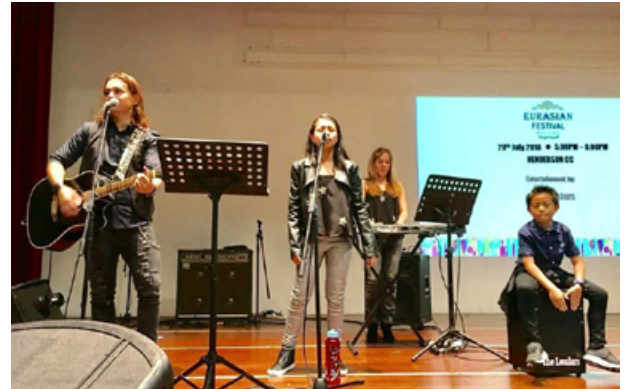
The Lesslars putting on a show at the Eurasian Festival at Henderson CC on 28 July 2018.

For those who wish to keep themselves abreast of the band's latest happenings, you may follow them on Facebook, Instagram and YouTube.