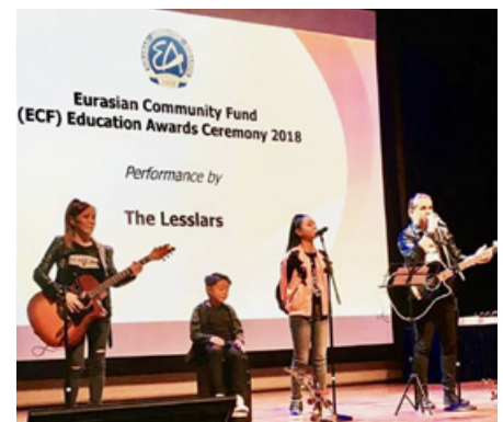
The Lesslars wowed attendees at the Eurasian Community Fund (ECF) Education Awards Ceremony with their hit singles.