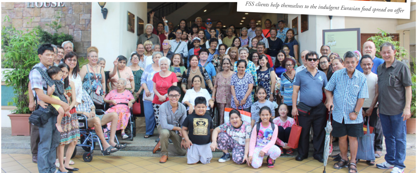
FSS clients and volunteers pose for a group photograph after a successful Family Day event