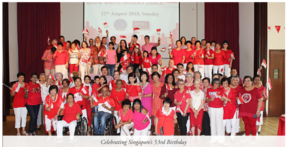
Celebrating Singapore's 53rd Birthday

Decked out in patriotic red and white, more than 100 EA members and guests enjoyed a lunch of multi-racial cuisine prepared by Quentin's Eurasian Restaurant, in celebration of Singapore's 53rd birthday.