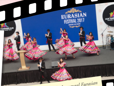
Eurasian Folk Dance at the Inaugural Eurasian Festival @ Tampines Hub in April 2017