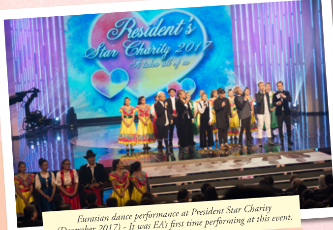
Eurasian dance performance at President Star Charity (December 2017) - It was EA's first time performing at this event.

The EA is calling for the Eurasian community to step forward as volunteers to help at the various events. Help shine a light on Eurasian culture, and share it with fellow Singaporeans.