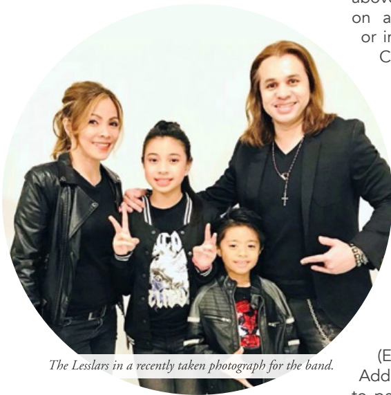
The Lesslars in a recently taken photograph for the band.