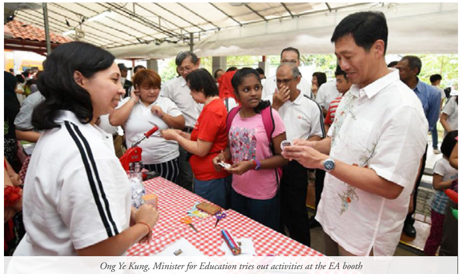
Ong Ye Kung, Minister for Education tries out activities at the EA booth

corner and a self-study area. It will offer educational programmes as well as