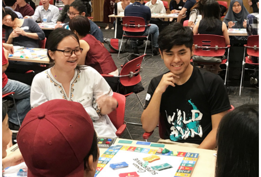
Mentorship session participants pitting their wits against each other through a board game

On 8 September, the last Mindfulness and Mentorship sessions took place. Participants were taught to blend together various tools, skill sets and refine them to create an effective pathway to success. Everyday skills such as short and long term goal setting, time management and study structures were examined and the