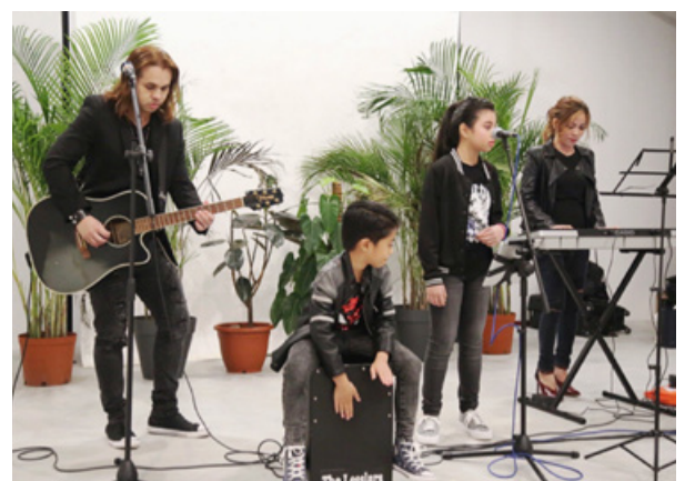
The Lesslars performing at a private event.

"We wish to perform as many shows as possible and to achieve our aspirations to reach to the top of our ambitions"