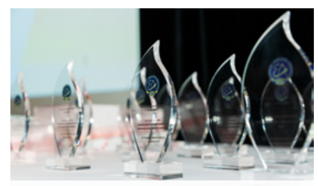
ECF Education Awards