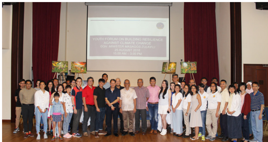
Forum participants pose for a group photograph with Minister Masagos Zulkifli after an insightful session