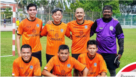
Members of the EA Soccer Team posing for a Team Photograph

Third edition of Malaysian Eurasian Games a show of good sportsmanship