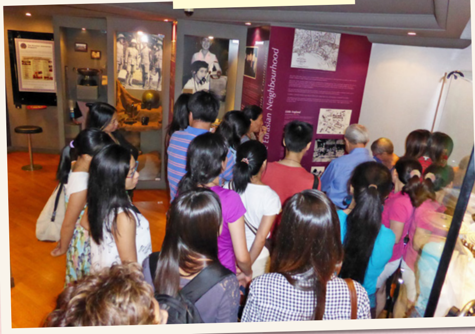
A tour group at the Eurasian Heritage Centre that is now closed for renovations

Among the EA's numerous efforts is the Eurasian Heritage Centre, at the Eurasian Community House on Ceylon Road.