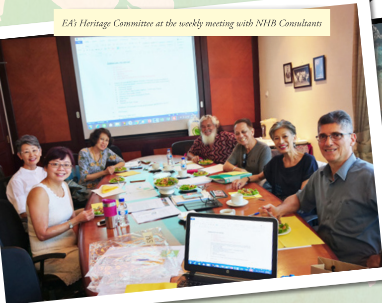
EA's Heritage Committee at the weekly meeting with NHB Consultants