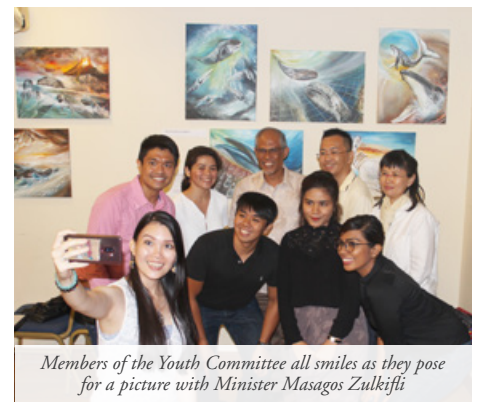
Members of the Youth Committee all smiles as they pose for a picture with Minister Masagos Zulkifli

There was a song launch of 'We are One' by Guardians of Mother Earth which was composed by Michele Chong. The aim of