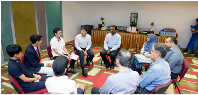
Ng Chee Meng, Minister in Prime Minister's Office having a discussion with the JTA Award Winners

as Singaporeans to honour and motivate our talents on the path to success."