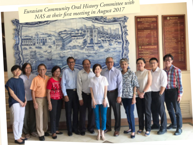
Eurasian Community Oral History Committee with NAS at their first meeting in August 2017