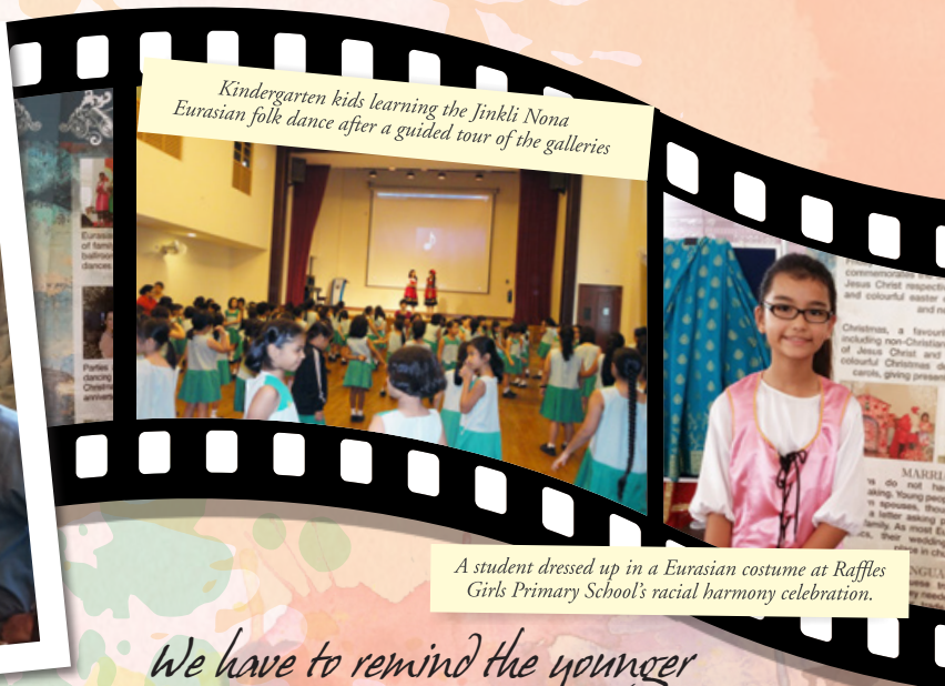
A student dressed up in a Eurasian costume at Raffles Girls Primary School's racial harmony celebration.

We have to remind the younger Eurasians of our history and heritage. We have a unique and important story to tell.