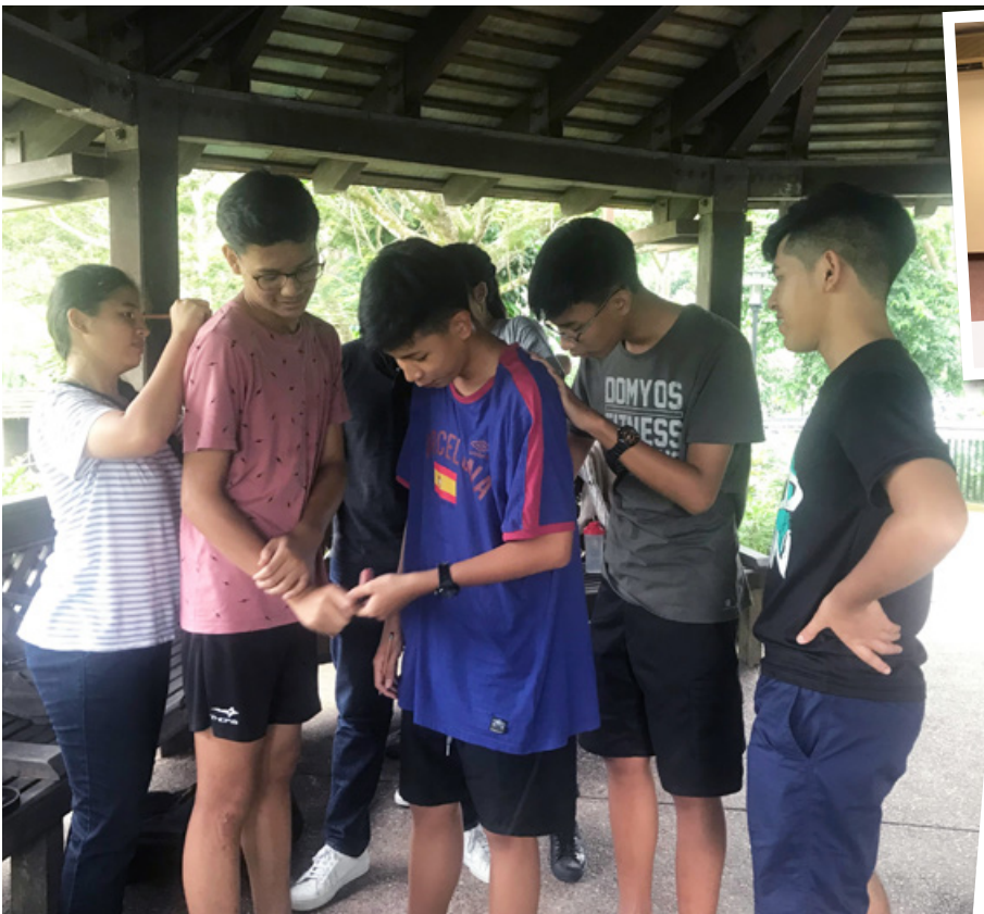
Mentorship session participants playing a game

students encouraged to share their experiences and how they have adjusted their use of these skills over time, to achieve greater success in their study preparations. Students provided positive feedback on how it helped them to enhance their memory retrieval and feeling very enlightened after the session.