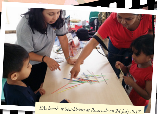
EA's booth at Sparkletots at Rivervale on 24 July 2017