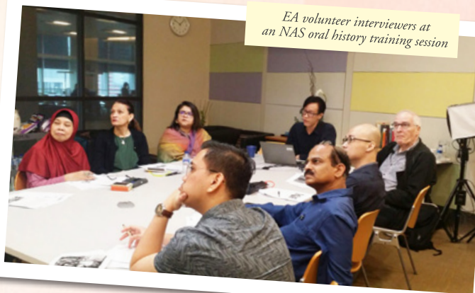
EA volunteer interviewers at an NAS oral history training session