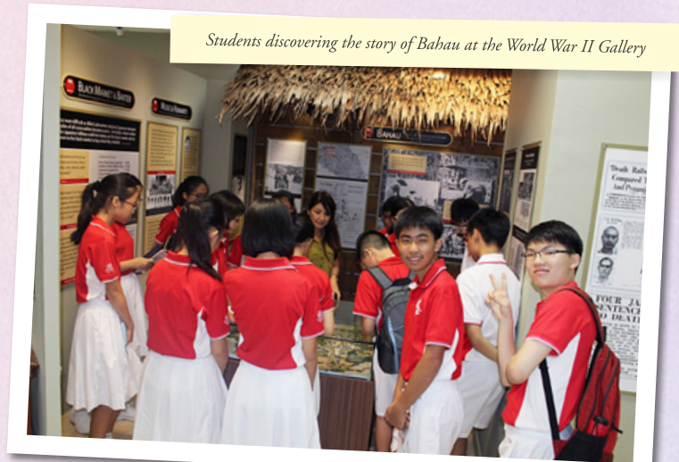
Students discovering the story of Bahau at the World War II Gallery