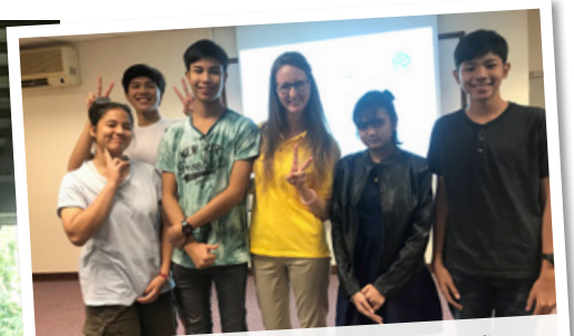
Mindfulness Workshop participants with their facilitator