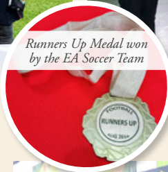
Runners Up Medal won by the EA Soccer Team

The 3rd Malaysian Eurasian Games 2018 kicked off on 18 August with teams from Penang, Selangor, Perak and Singapore.