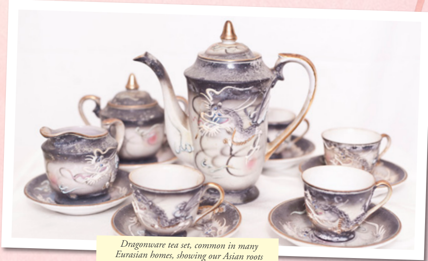
Dragonware tea set, common in many Eurasian homes, showing our Asian roots

We are often mistaken for foreigners, or asked what a Eurasian is, even though we are the fourth racial group in Singapore.