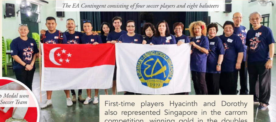
The EA Contingent consisting of four soccer players and eight baluteers