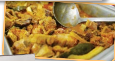
HOGAN'S DEVIL CURRY