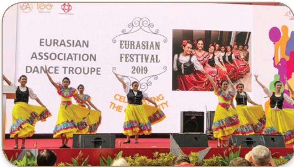
The EA Dance Troupe.