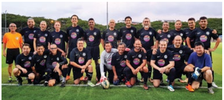
EA Men's Soccer team before the friendly game against Modello FC at SAFRA Tampines on 4 August.