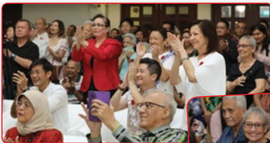
An appreciative audience.