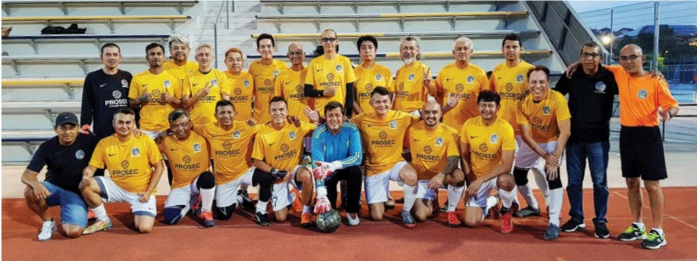
EA Men's Soccer team after the friendly game against Pasir Ris Secondary School (PRSS) Alumni at SUTD Sports and Recreation Centre on 17 August.