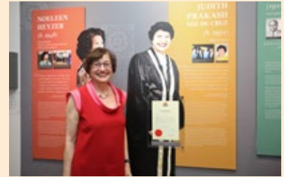
Judith Prakash nee De Cruz practised law for 18 years before being appointed a judicial commissioner in 1992, a Supreme Court judge in 1995 and (first female) Judge of Appeal in 2016.