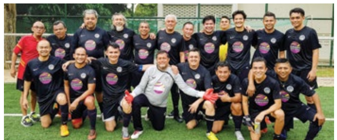
Before the match against Victoria Old Boys at Victoria School on 21 July.