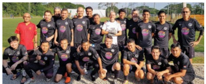
From left: EA Men's Soccer team strategising, and before the match against The Blue Team at The Cage Sports Park on 13 July.