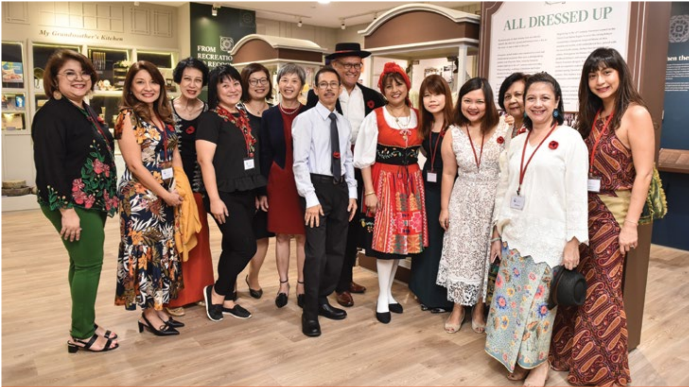
After its genesis as a simple showcase for Eurasian culture in 2003 and undergoing major extensions in 2006 and 2011, The Eurasian heritage centre has morphed into the Eurasian Heritage Gallery, now bigger, brighter and bolder than ever before! Here are the EHG docents, all dressed up and ready to share the amazing Eurasian story with you!

It took years in the making, but it was an achievement to crown all others in EA's centennial year.