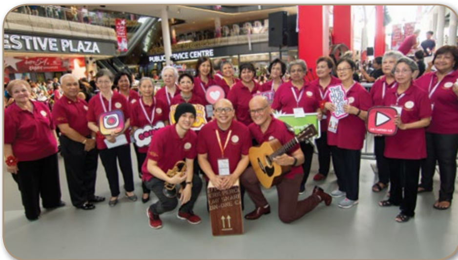
The EA Choir.